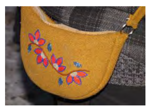
Beaded bag by Sahtú artisan

25.4.2 (a) The objective of the Land and Water Board is to provide for conservation, development and utilization of the land and water resources of the settlement area in a manner that will provide the optimum benefit therefrom for present and future residents of the settlement area and the Mackenzie Valley and for all Canadians.