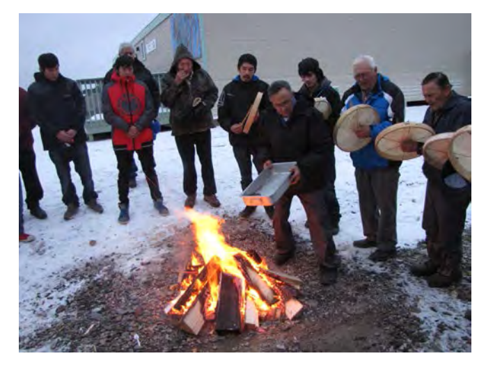
Feeding the Fire ceremony in Tulít'a

The results of those discussions are summarized in the boxes below.