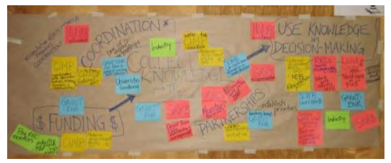
Map of roles in environmental research and monitoring: funder, collector of knowledge, partner, decision-maker