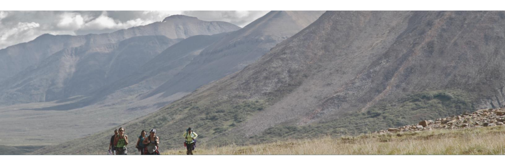
On the land quardian training.

As we head into summer 2019 we have many exciting developments and much progress to report on our joint planning efforts for Shúhta Gozepé / Bedzih / Kudzih (Northern Mountain Caribou) in the Mackenzie Mountains. It's been a very busy time over the last several months! This newsletter outlines our main recent achievements and next steps for work.