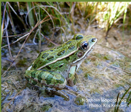
Northern leopard frog

The NWT Species Conservation and Recovery Fund focuses on the conservation and recovery of species at risk. In order to emphasize actions aimed directly at recovery, projects will be granted funding according to a tiered priority system. Priorities have been established based on how projects link to recovery strategies or management plans, species focus, and the main purpose or objective of the project.