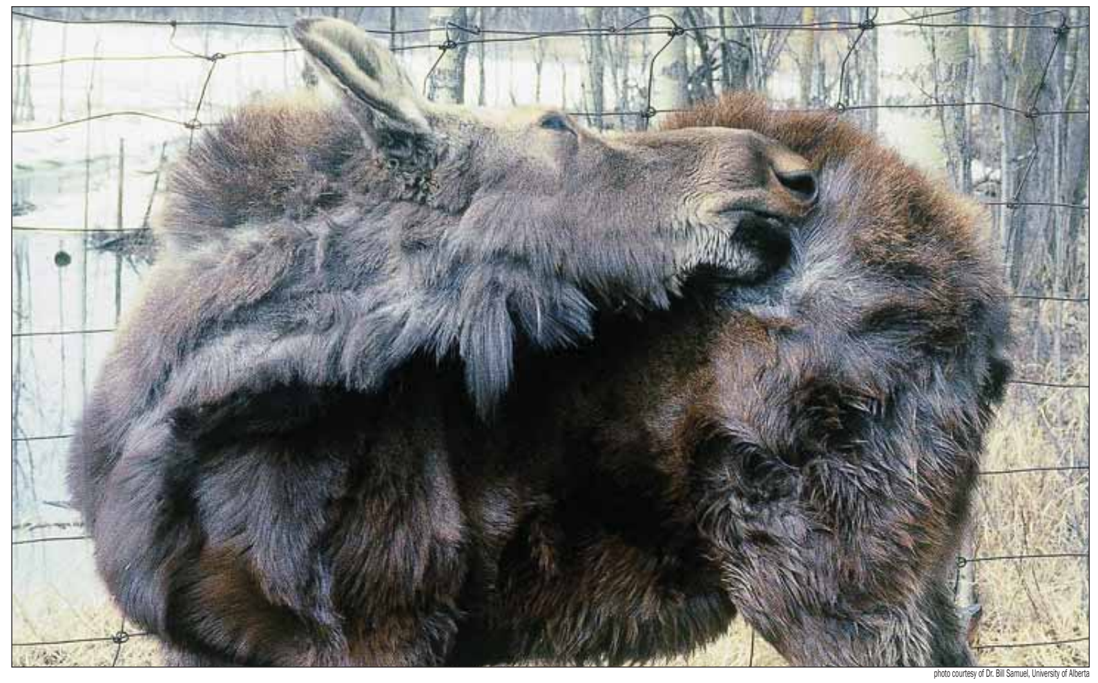
A moose infected with ticks. It takes an infestation of around 50,000 ticks to kill an animal. Although moose in NWT typically carry a few hundred at a time, animal carcasses in the south have been found with as many as 100,000 on them.

The Department of Industry, Tourism and Investment said in a news release the GNWT plans to spend $2.5 million in upgrading and maintaining park infrastructure this year. The plans include new hiking trails in Gwich'in Territorial Park and improvements to Prelude Lake's marina and shoreline. Camping sites are available for pre-booking on the territorial government's NWT Parks website.