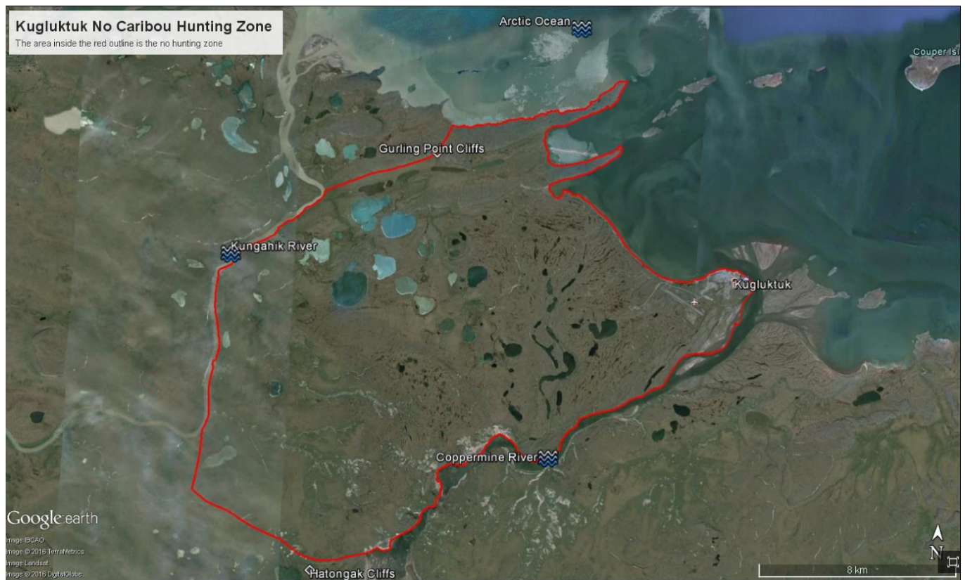
Figure 1. The Proposed KHTO “No Caribou Hunting Zone” outlined in red. This zone is bounded by the Kugluk (Coppermine) and Kungnahik (Richardson) River, the arctic ocean, and a set of well known cliffs in the Hatongak area to the southwest and the Gurling Point Cliffs to the northeast.

The KHTO proposes to establish an Article 5.7.3 non-quota limitation on harvesting that prohibits caribou harvesting in this area, which is shown in Figure 1 and Figure 2. This area is about 300 square kilometers of the most easily accessible hunting areas from the Hamlet of Kugluktuk. There are clear land marks in this area that can be used to establish this no hunting zone for caribou that include major rivers and cliffs. The establishment of this zone will result in significant reduction in caribou harvest in years and seasons when the BNECH migrates close to town through this area. Further, many hunters are not adequately resourced or trained to harvest caribou respectfully, and too many hunters in this area can pose a human and hunter safety issue.