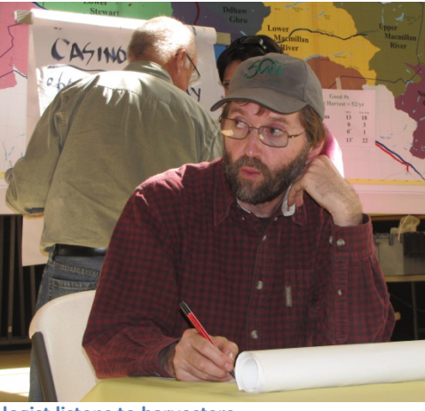
L-R: Map of Management Blocks, and Yukon Wildlife Biologist listens to harvesters.