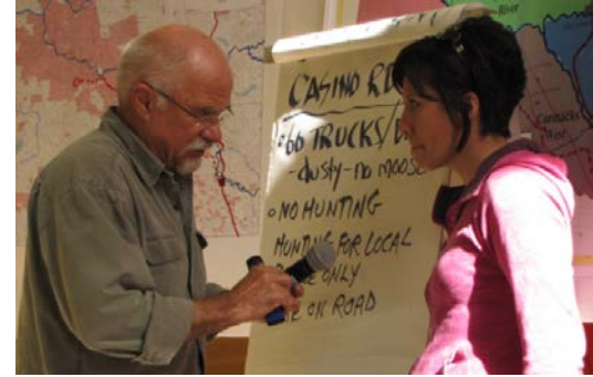
First Nation Harvest Study Report

Consensus is sought on the harvest levels or other measures needed to maintain healthy populations. Key decisions are written as