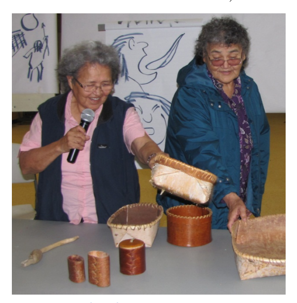
Impromptu Birch Basket Demonstration

All of the First Nation leaders are welcome to attend. Some of them did attend, which