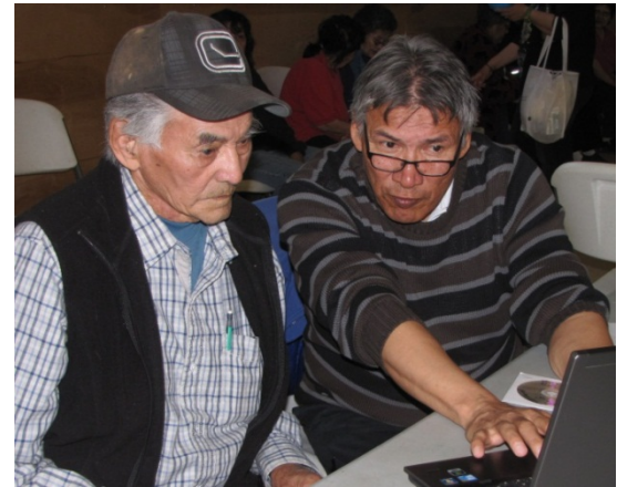
Mapping Relationships on Google Earth

My interests in First Nation history kept me busy with as many elders as I could talk to. The Northern Tutchone language is part of the Athapaskan language family, and the elders could pick up about ten percent of what I was saying in my Sahtúgot'ıne language. I could understand about the same and more if they wrote it. Other than the elders, very few could speak their language. I could tell from the stories that much has been lost through history....from the gold rush of the late 1800s, to the present day gold rush.