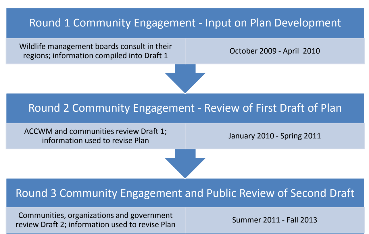
Figure 1: Flow chart showing the community engagement process in developing 'Taking Care of Caribou – the Cape Bathurst, Bluenose-West, and Bluenose-East Barren-Ground Caribou Herds Management Plan'.

Round 3 engagements took place in Tulít'a, Colville Lake, Déline, Fort Good Hope and Norman Wells between August and October 2011. These meetings were public meetings held by ENR to review the revised or second draft Management Plan. ENR also did presentations and held discussions in five schools of the Sahtú to engage high school students. Comments were recorded during all meetings and provided to the ACCWM and the Working Group.